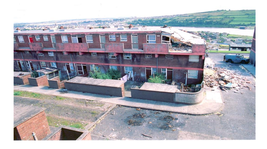
Rear view of 38 Kildrum Gardens (top floor flat)