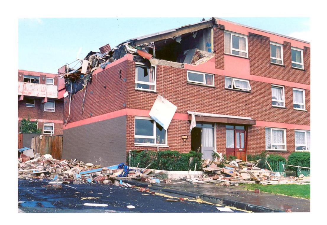
Front view of 38 Kildrum Gardens (top floor flat)