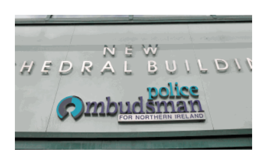
Officers did not fail to protect child