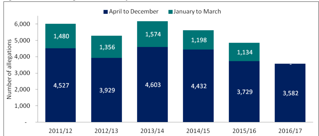
Figure 2: Number of allegations received by the Police Ombudsman's Office, 2011/12 to 2016/17

The Office received almost 3,600 allegations between April and December 2016. This is the lowest number of allegations received during this time period when compared with the last five years (Figure 2).