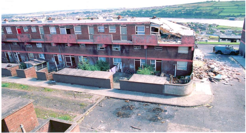
Rear view of 38 Kildrum Gardens (top floor flat)