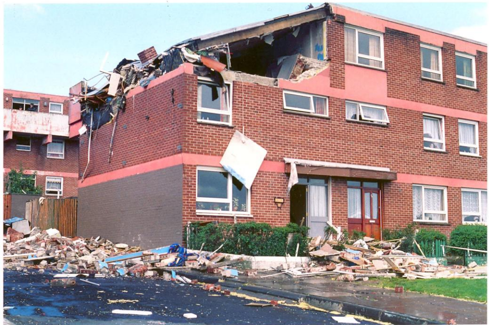
Front view of 38 Kildrum Gardens (top floor flat)